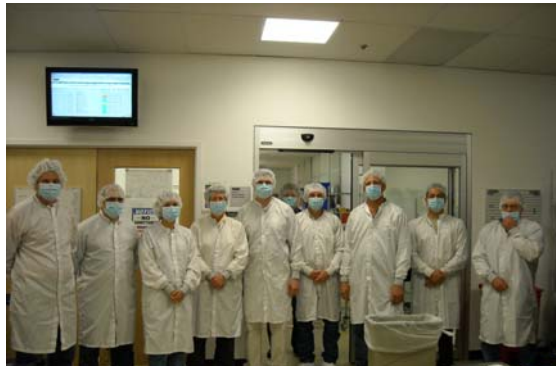
Plant Tour of Zygo Corporations One of Connecticut's "LEAN to GREEN" leaders

Leanovations, LLC 117 Northwest Drive Plainville, CT 06062 Office: (860) 479-0293 Fax #: (860) 747-4342 www.leanovations.com or e-mail us at: info@leanovations.com